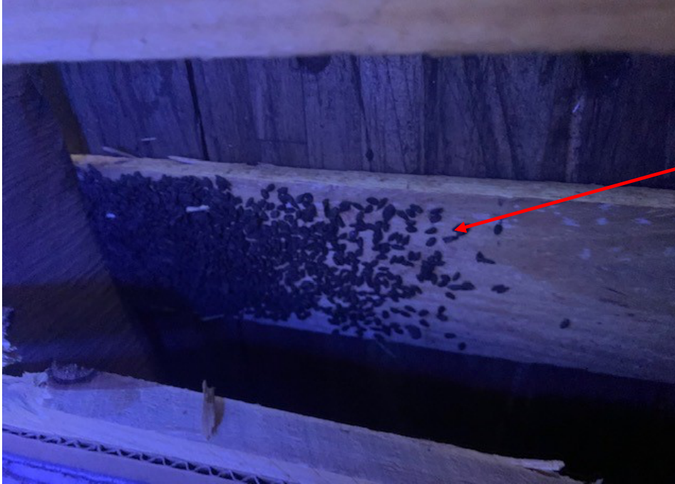
Example: Rodent droppings on a pallet