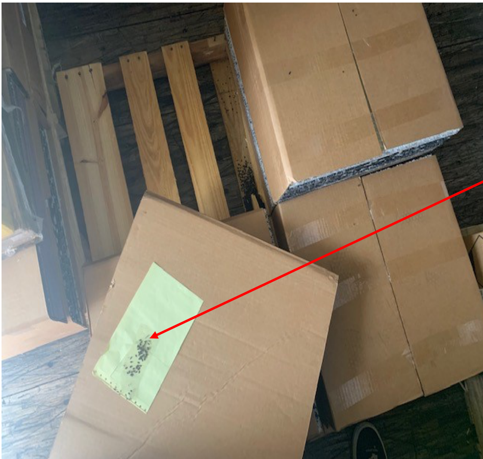
Example: Rodent droppings on cardboard