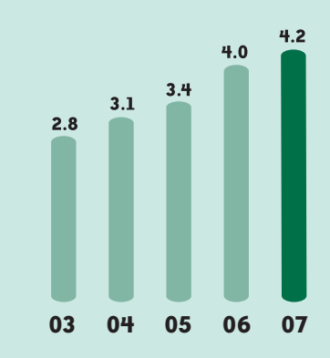
($ In Billions)